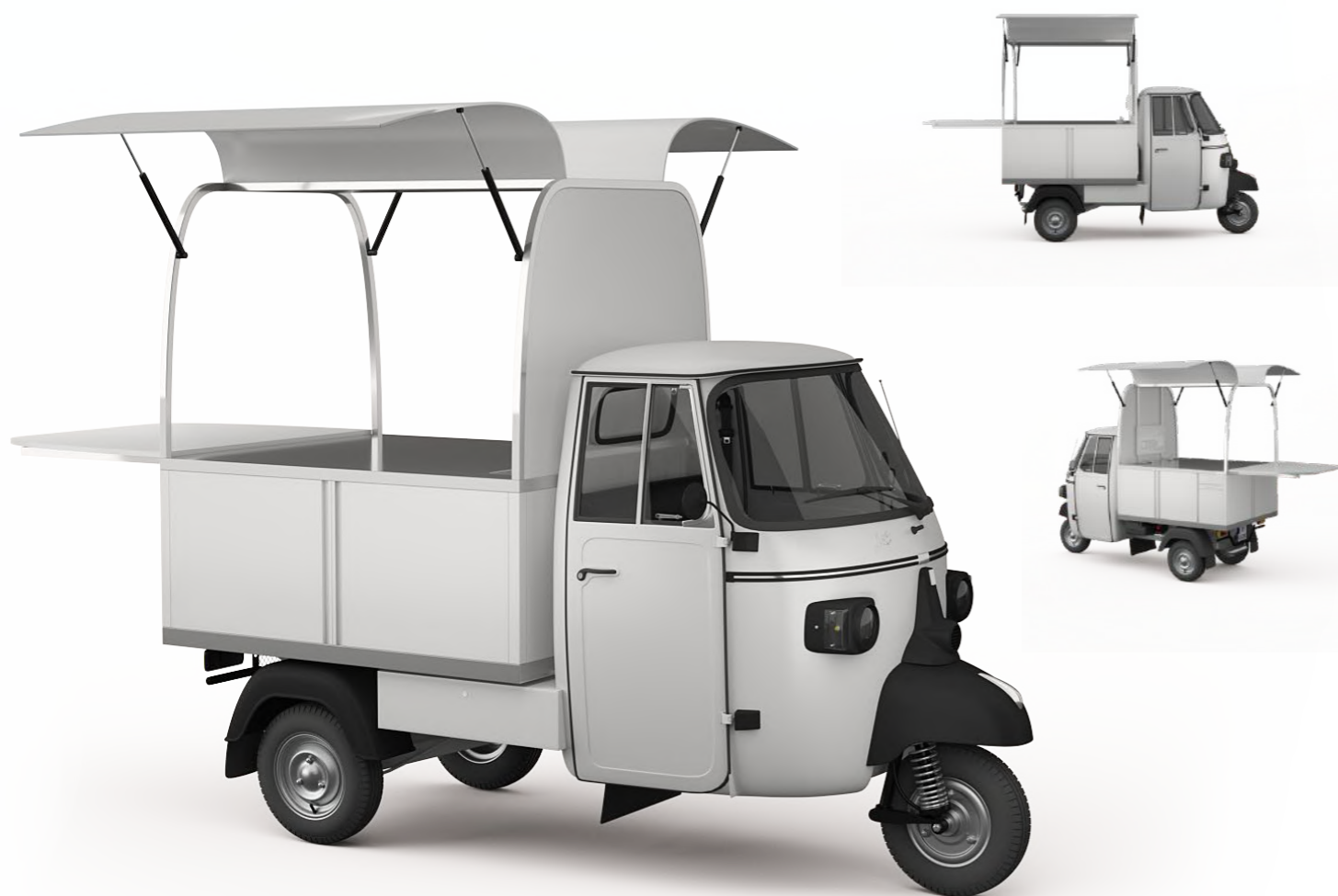
It is an illustrative drawing.