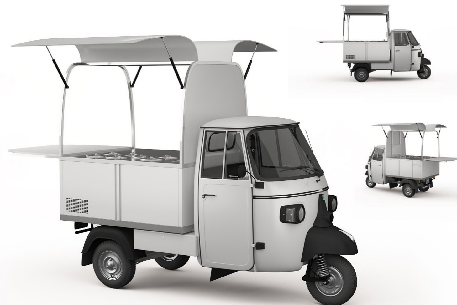
It is an illustrative drawing.