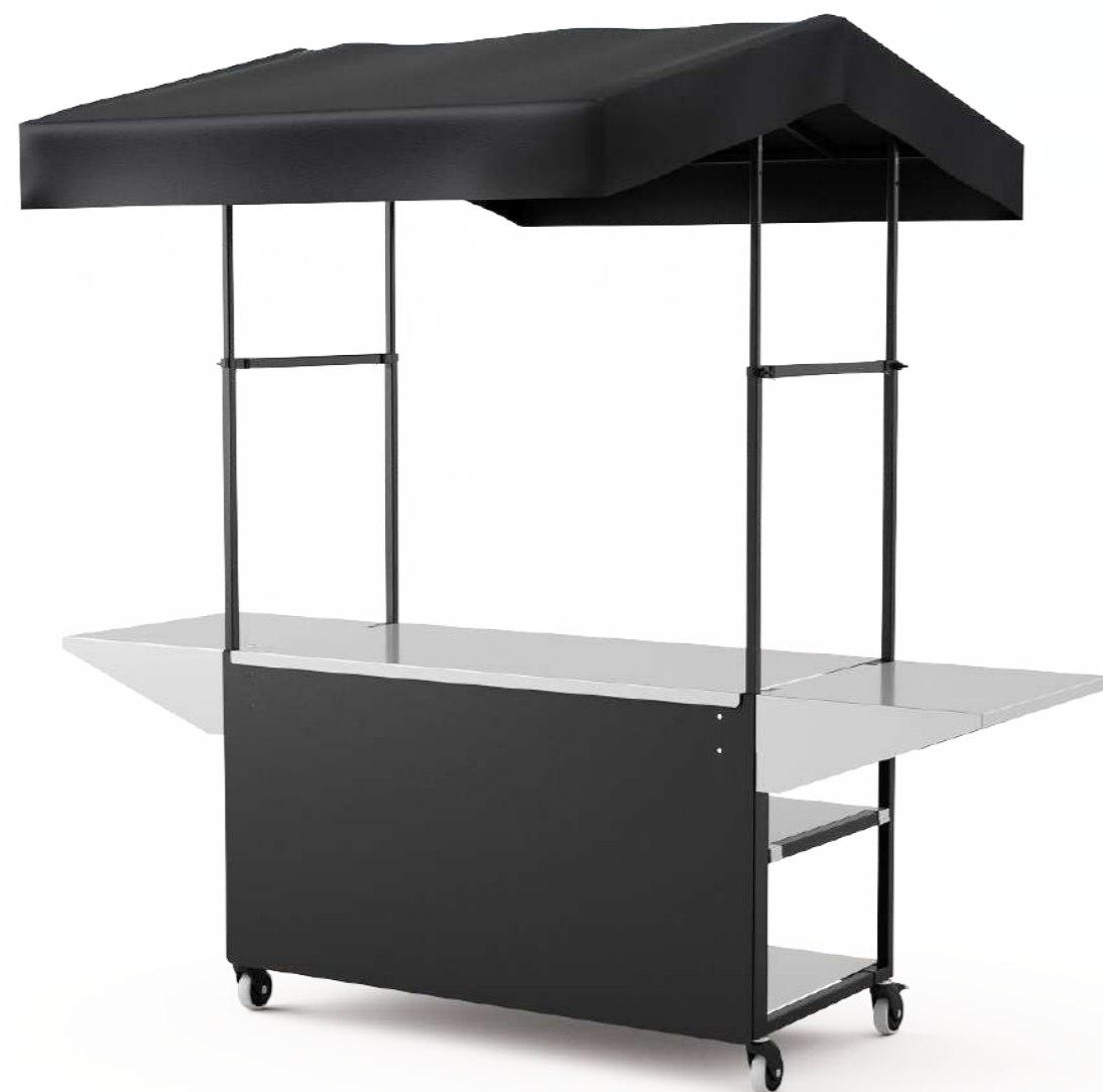
It is an illustrative drawing.