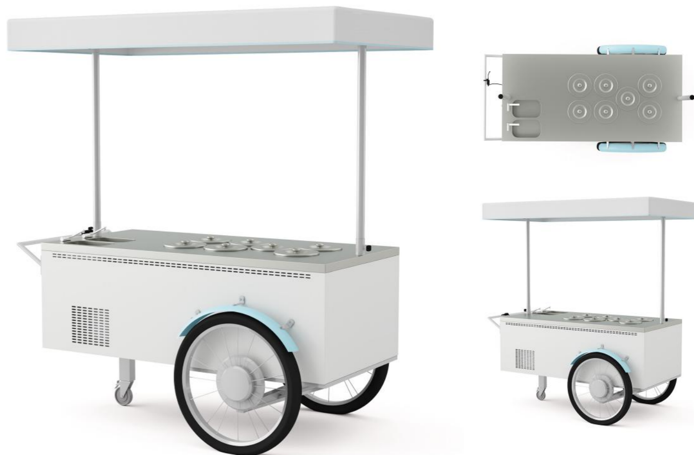
It is an illustrative drawing. The price does not include pozzetti.