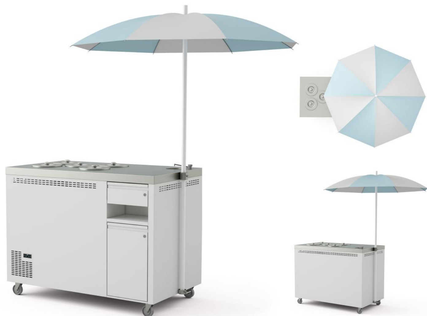
It is an illustrative drawing. The price does not include pozzetti.