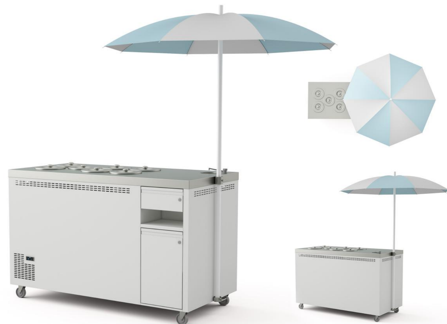
It is an illustrative drawing. The price does not include pozzetti.