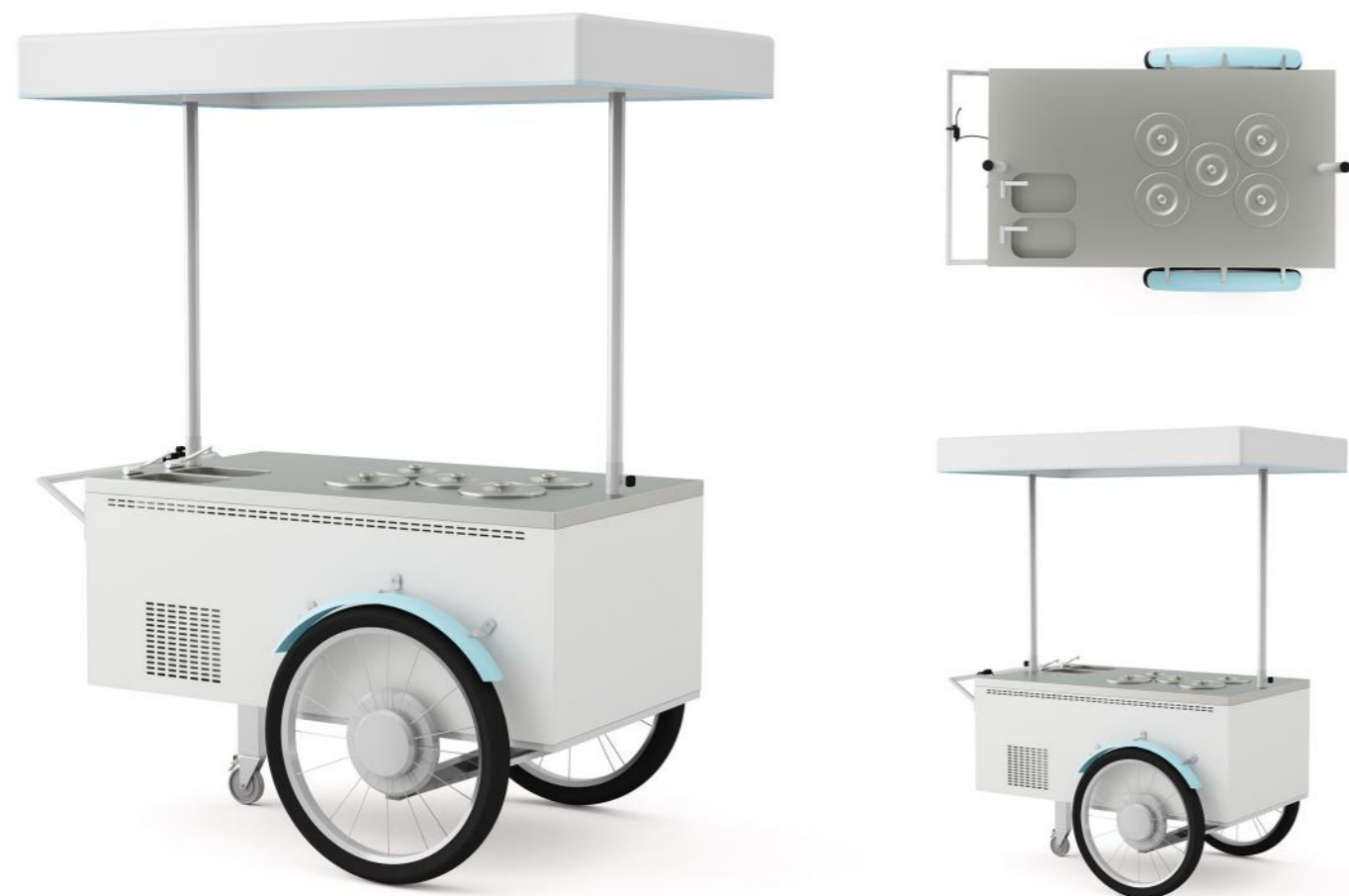
It is an illustrative drawing. The price does not include pozzetti.